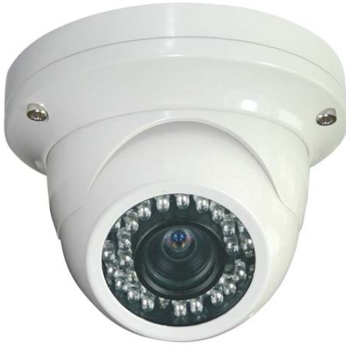
SONY 700TVL Solution Effio-E + 673 CCD With OSD