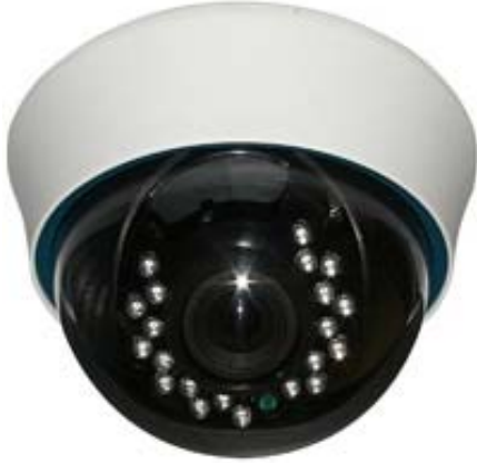
SONY 700TVL Solution Effio-E + 673 CCD With OSD